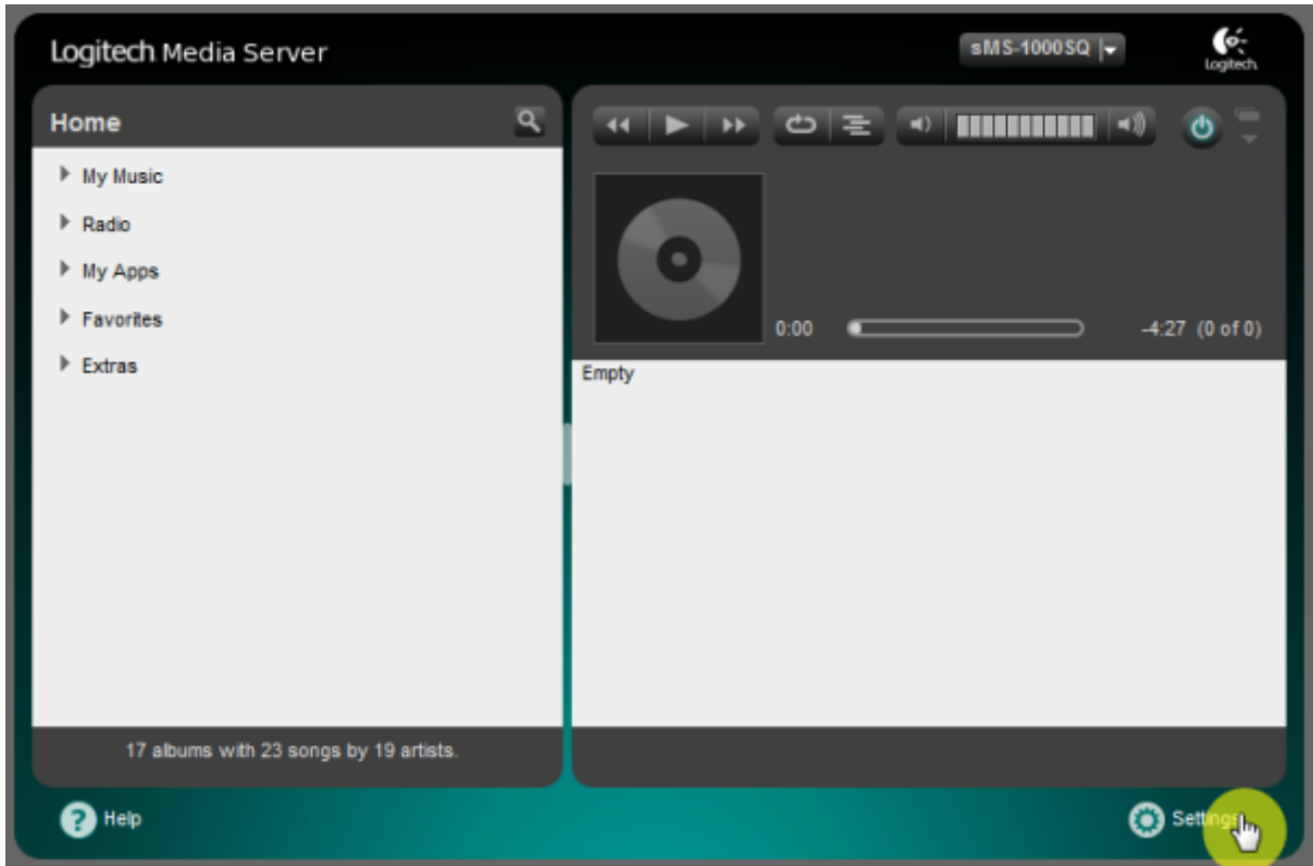
Basic Settings "Rescan"